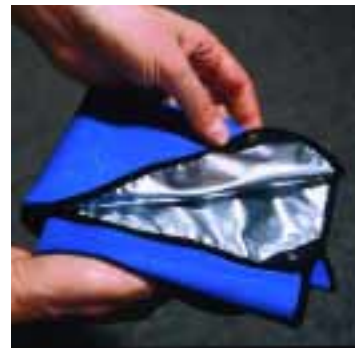
f. Emergency Blanket

The Museum of Safety Gear for Small Animals is the largest museum of safety gear for small animals in the world. It is an itinerant museum in three parts: the safety gear collection, the multi-media program, and the publishing house.