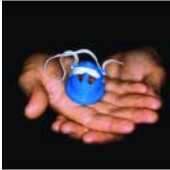
g. Dust Mask