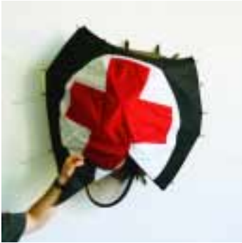
a. Triage Tent