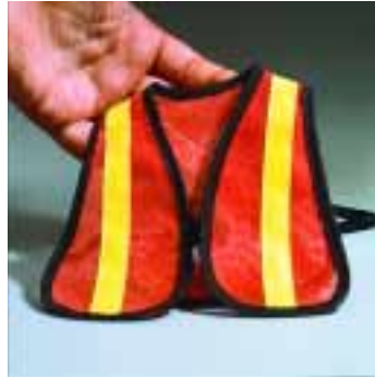
b. Safety Vest