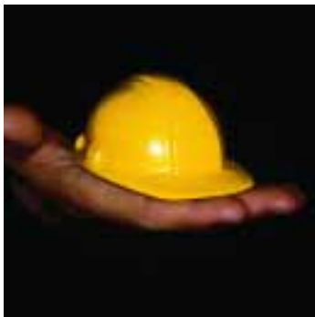
j. Hard Hat