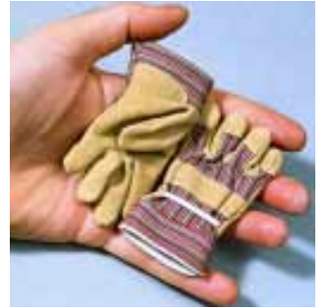
c. Work Gloves