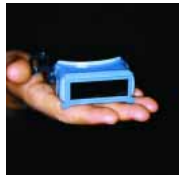
l. U.V. Goggles

Central to the museum's collection are nineteen pieces of scale model safety and rescue gear. The total weight of the safety gear collection is 944 grams. The pressure of the vacuum table used to produce the safety gear is eighty-four kilograms per square centimetre. If all the materials from the collection were unraveled in a line one micrometre thick it would stretch around the Earth's equator two and three-quarters times. Forty-three different fasteners are used in the construction of the safety and rescue gear. There are 2,750 machine stitches and 234 hand stitches in the museum's safety gear collection.