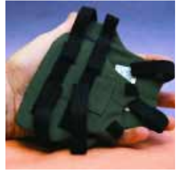
i. Bullet Proof Vest