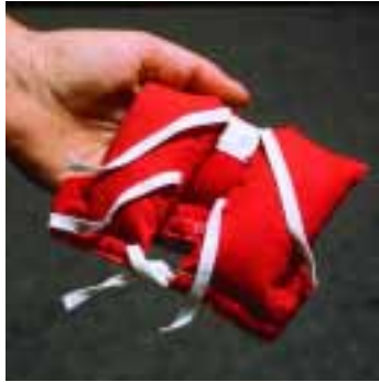
h. Life Jacket