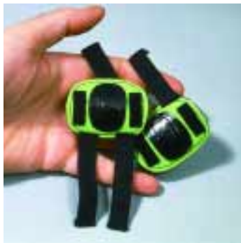
k. Knee Pads